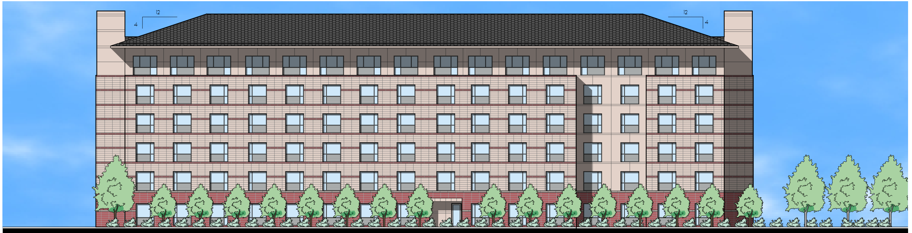
1 EAST ELEVATION SCALE: 1" = 20'