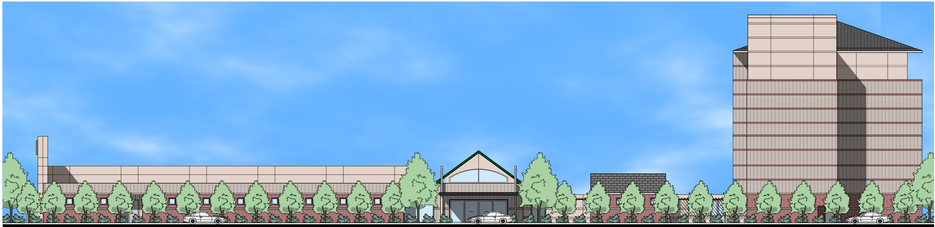
2 SOUTH ELEVATION SCALE: 1" = 20'

COPPELL CONFERENCE CENTER AND HOTEL COMPLEX LOT 2 BLOCK C, DIVIDEND DRIVE & POINT WEST BOULEVARD, COPPELL, TEXAS, 75019