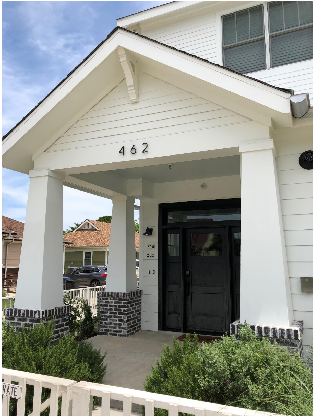
George Coffeehouse Side Entrance