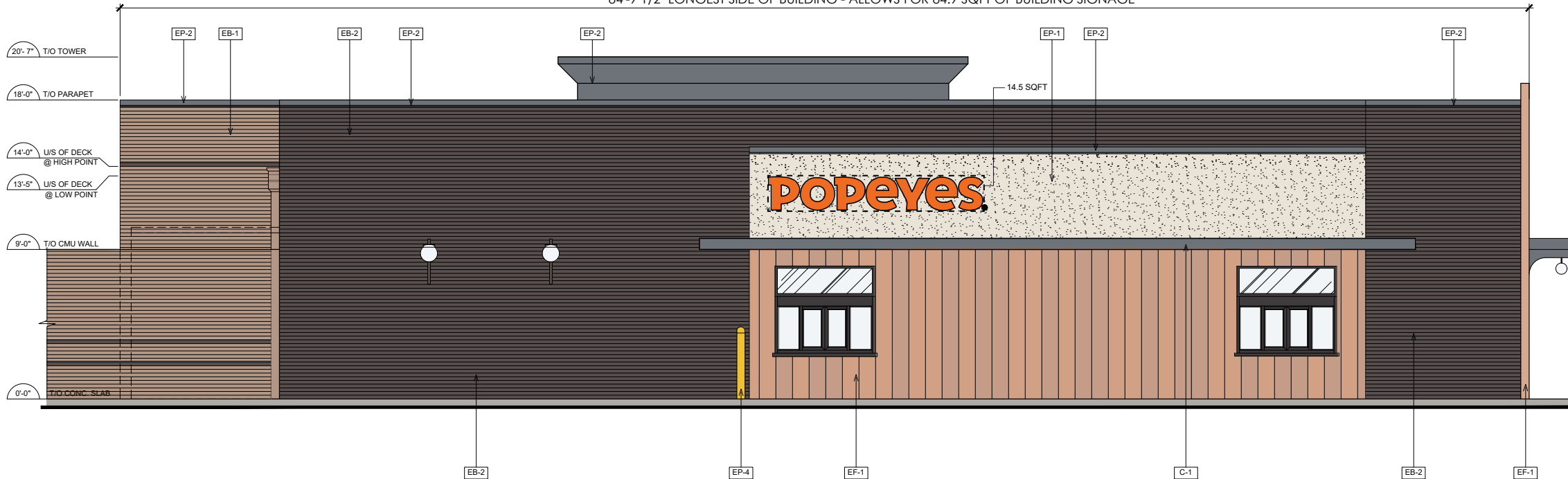
2 PROPOSED DT ELEVATION SCALE: 1/4"=1'-0"