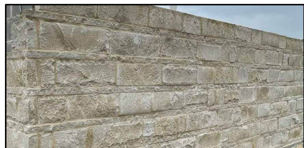
CHOPPED LUEDERS STONE REFERENCE IMAGE