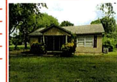
528 S. Coppel Road Coppell, Texas

Republic Title of Texas, Inc. 8810 MacArthur Boulevard Irving, Texas 75063 Ph: 972.401.0222 Fax: 972.401.0333