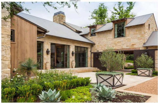
CONCEPT MAIN HOUSE