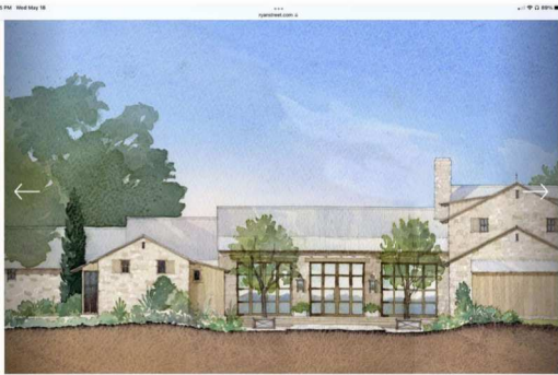
CONCEPT MAIN HOUSE