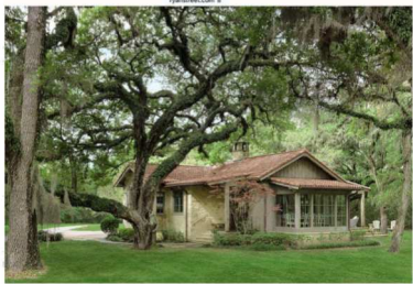
CONCEPT PARENT HOUSE