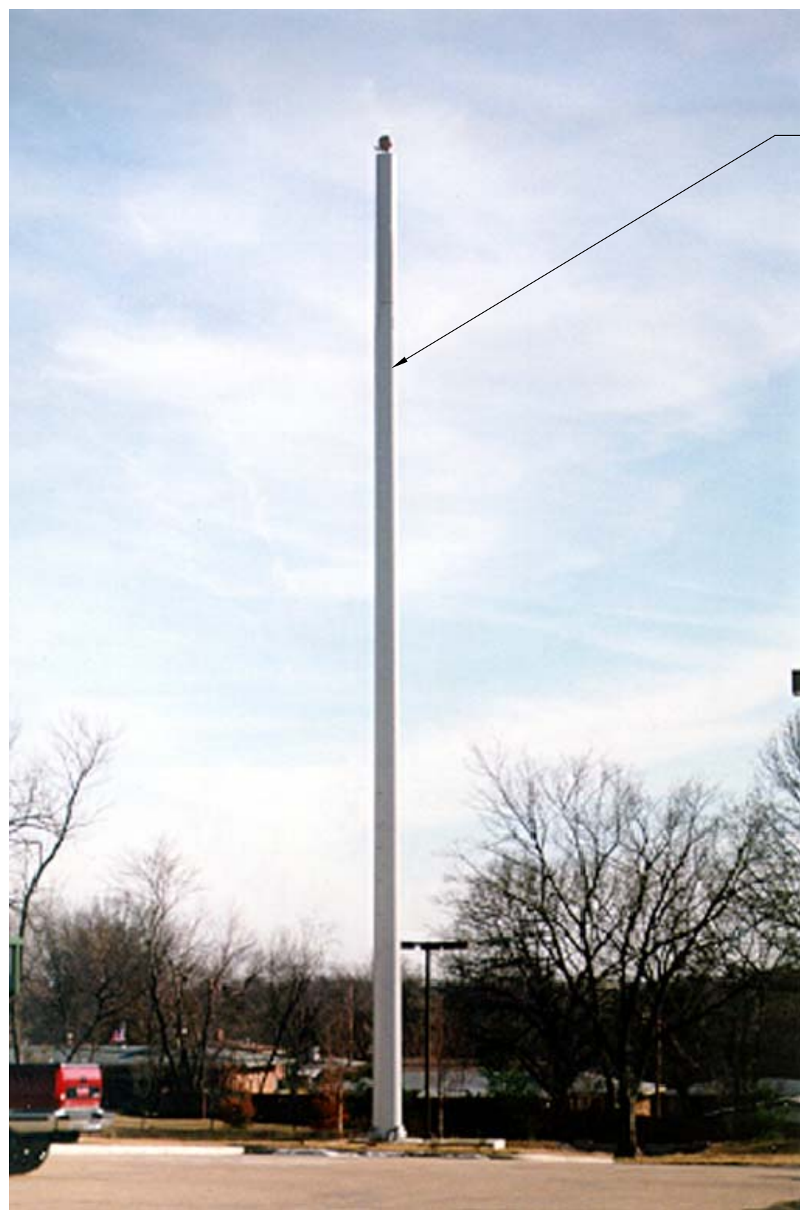
EXAMPLE OF NEW STEALTH TOWER FOR REFERENCE ONLY. (PAINT WITH SHERWIN WILLIAMS - ALABASTER - SW7008)