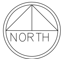
1 ENLARGED SITE PLAN SCALE: 1/4" = 1'-0"