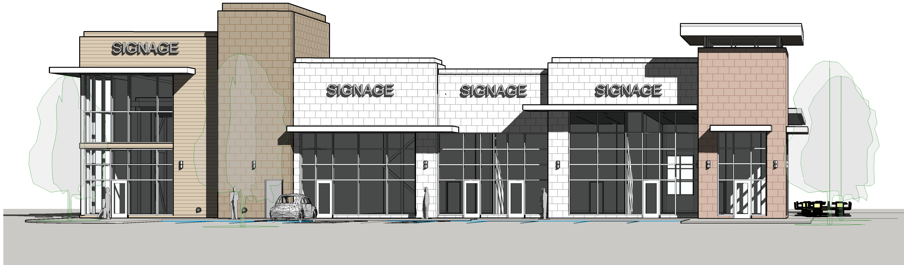
② Front Perspective View