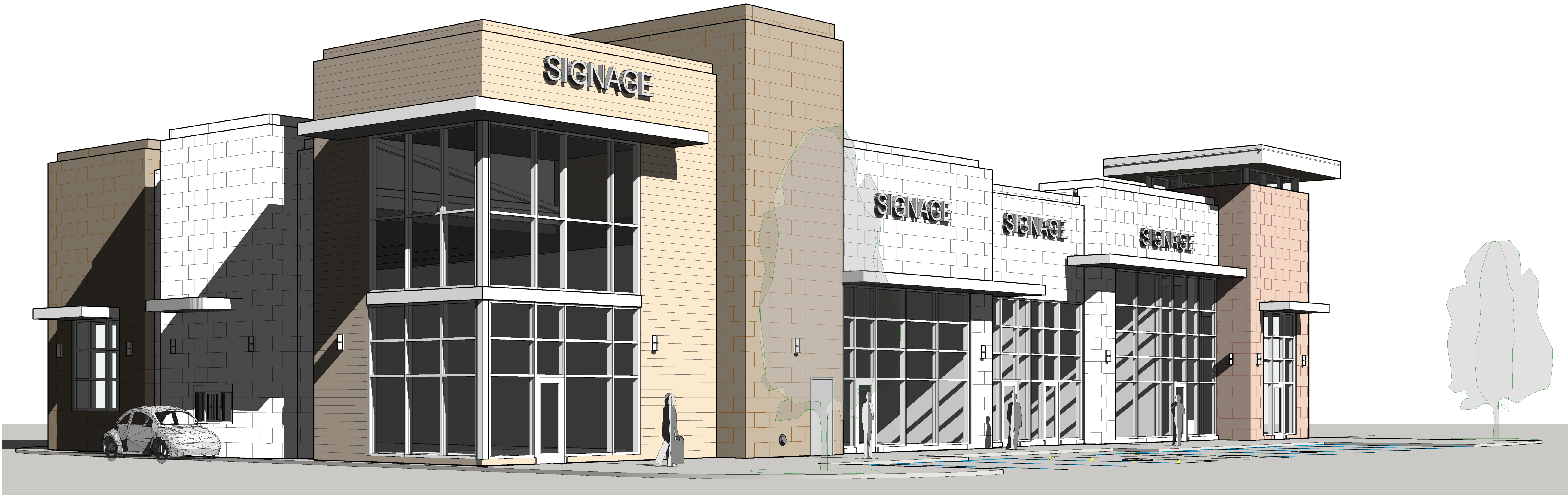
① Perspective at South East Corner