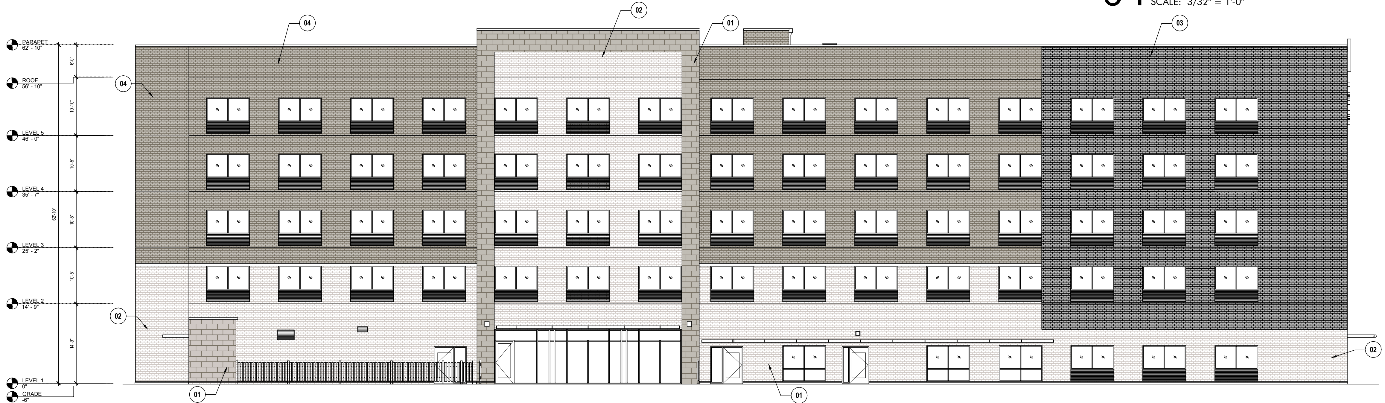
03 EAST ELEVATION SCALE: 3/32" = 1'-0"