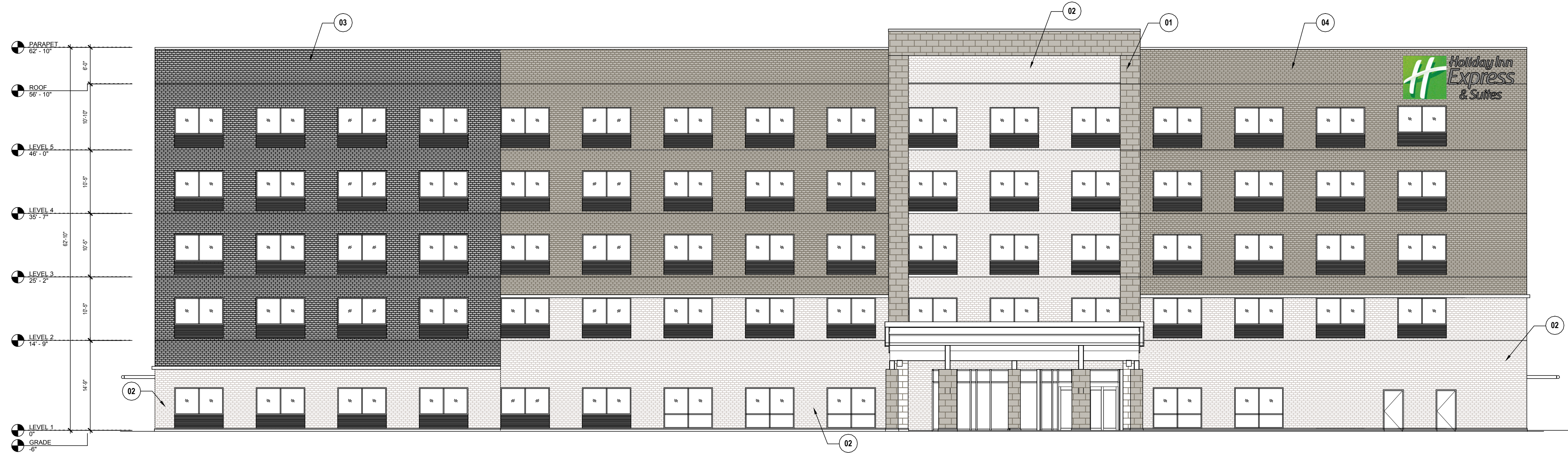
04 WEST ELEVATION SCALE: 3/32" = 1'-0"