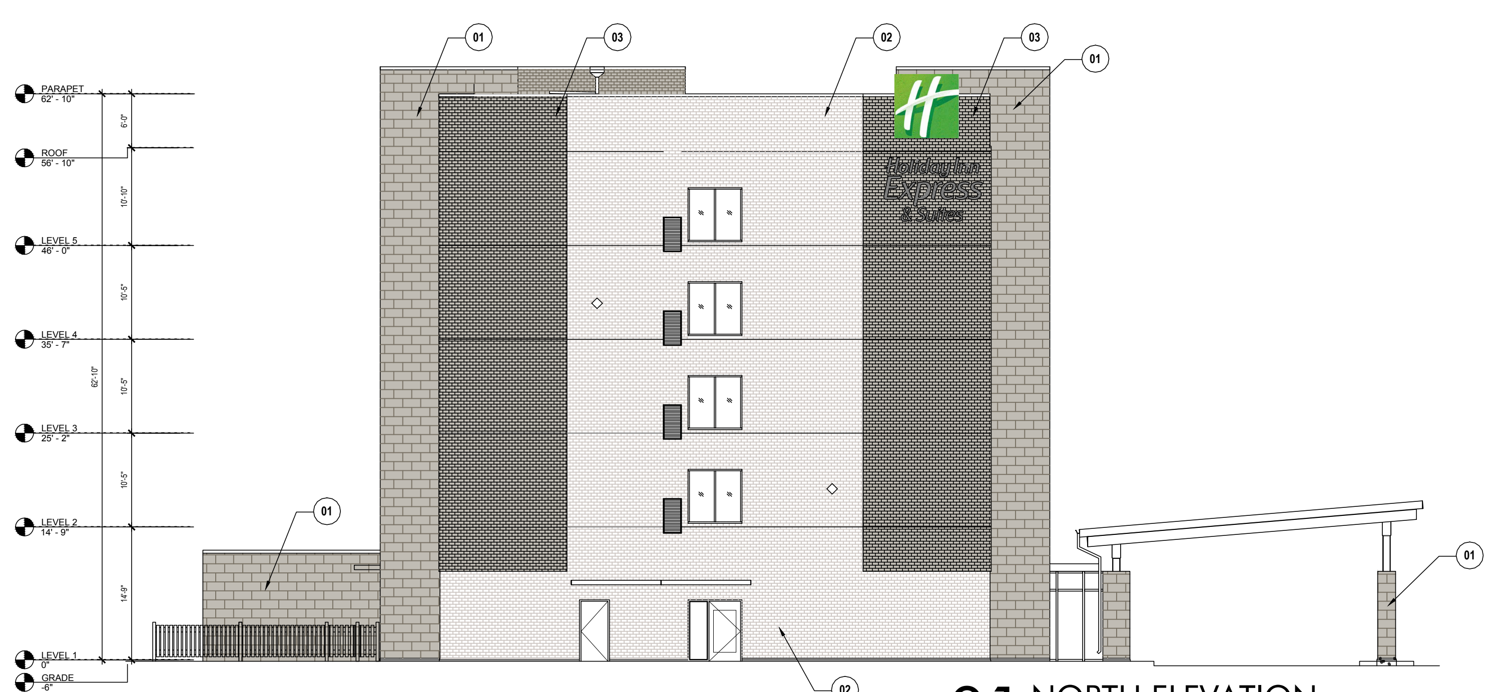
01 NORTH ELEVATION SCALE: 3/32" = 1'-0"