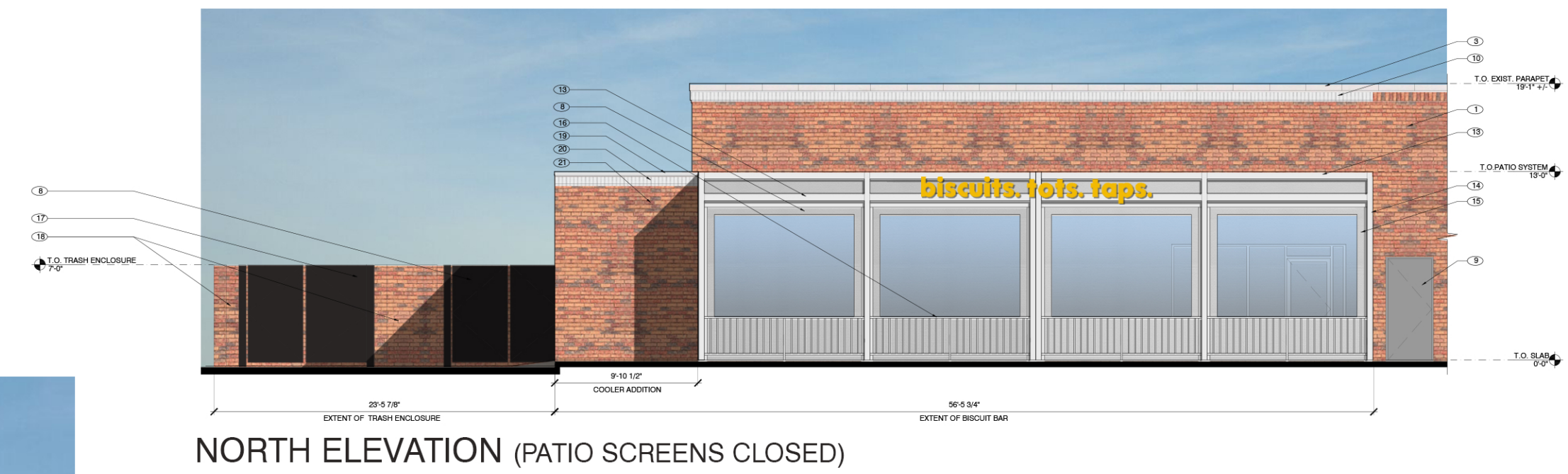
NORTH ELEVATION (PATIO SCREENS CLOSED)