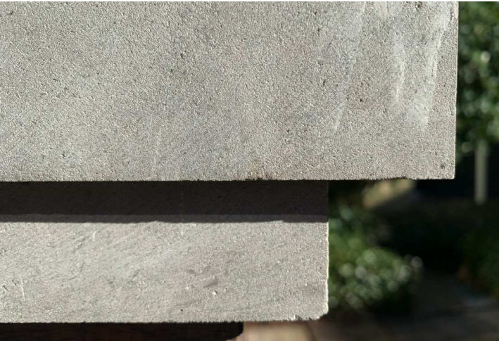
8 STONE TRIM - CUT