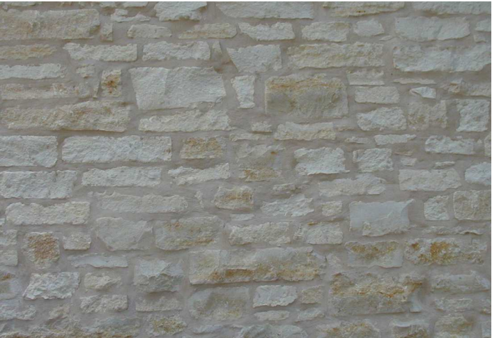
9 STONE VENEER - CHOPPED