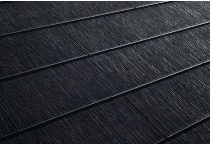
2 TESLA ROOF