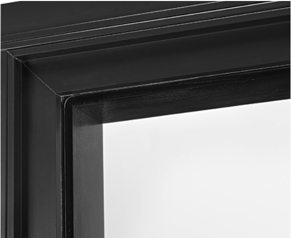
7 WINDOW & DOOR FRAMING